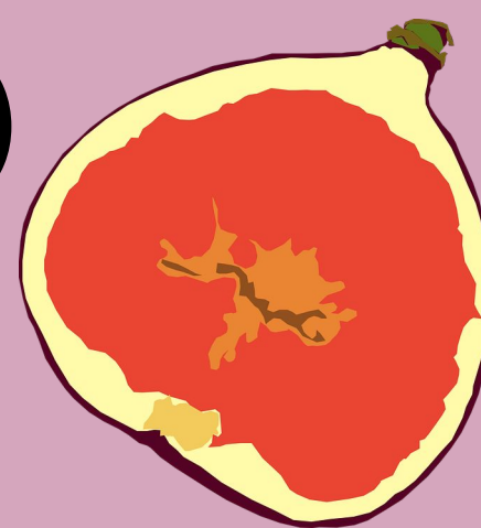
Fig trees are also commonly roost sites. These bats are highly social and live in year round Roosts with offspring.

These bats are nocturnal frugivores and rely on fig ( Ficus ) trees found in undisturbed and remote forests