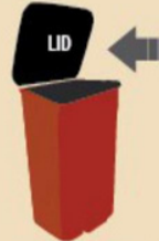
SECURE KITCHEN TRASH