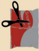
DESTROY ALL BAGS