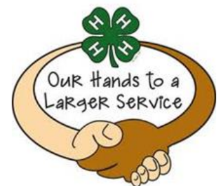
Thanks to everyone who helped with this community service project!