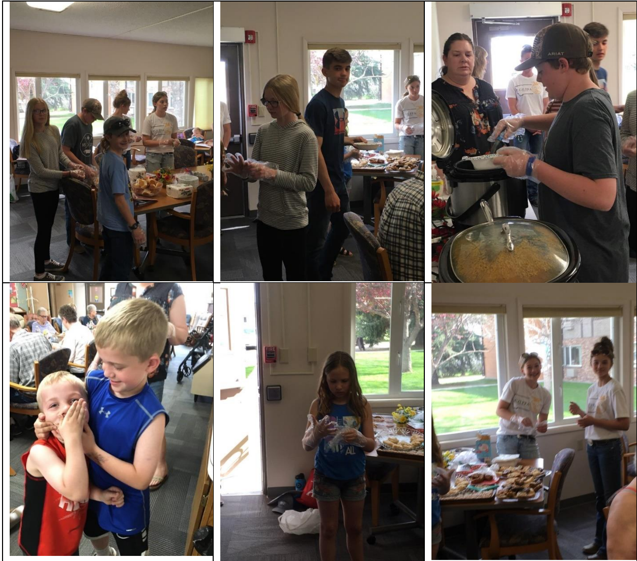
Tiber 4-H Club served soup to the Sweetgrass Lodge residents and had a little fun too!