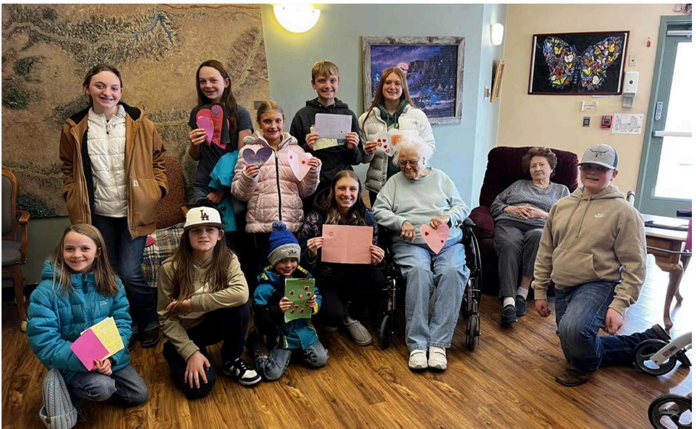
The Open Range 4-H club met up at the Northern Pines Nursing Home to deliver handmade Valentine cards that they made at their February meeting as part of the 4-H Has Heart Nationwide project. There were over 36,000 Valentines pledged to be delivered to local nursing homes in all 50 states and Canada. A 4-Her from Oklahoma had a vision and created this wonderful project to bring some Valentine cheer to the elderly population. What a difference 4-H makes in communities!