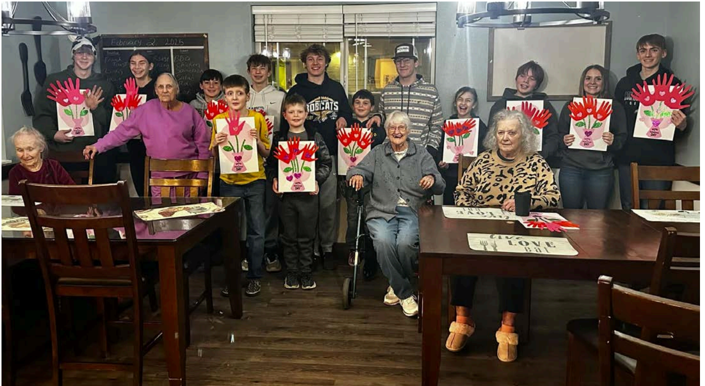
Longview 4-H club members enjoyed collaborating with the local Beehive residents on a fun Valentine's Day craft at their February meeting. Nice job on those Valentine's!

I pledge...my hands to larger service, for my club, my community, my country, and my world.”