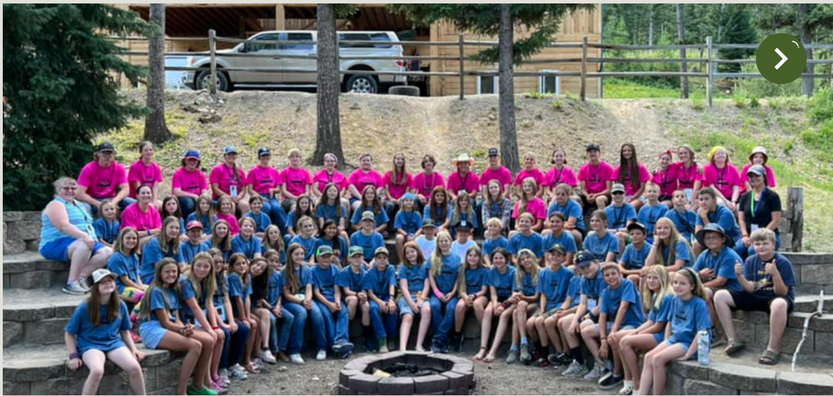
2022 4-H Summer Camp