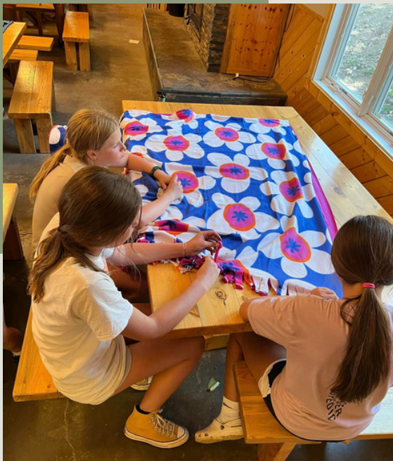
Blanket making service workshop 2022 4-H Summer Camp