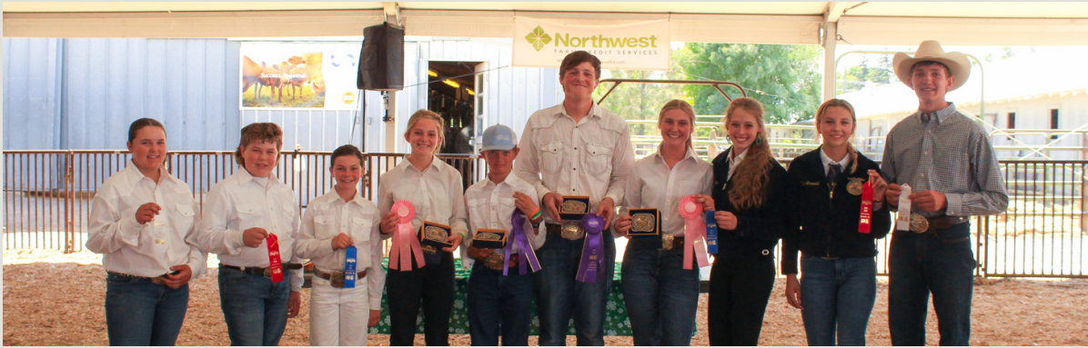
2022 Round Robin Winners

Gallatin County 4-H would also like to take this opportunity to thank the members of Gallatin 4-H Foundation, Unlimited Leaders Council, and Market Livestock Committee for their tireless support and generosity for the 2021-2022 4-H year.