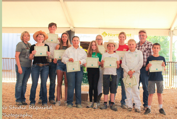
2022 Bob Brownell Heardsmanship Award Winners

Thank you to these sponsors. Their generosity helps support the youth of both 4-H and FFA, covering the costs of various items needed for a safe and successful fair.