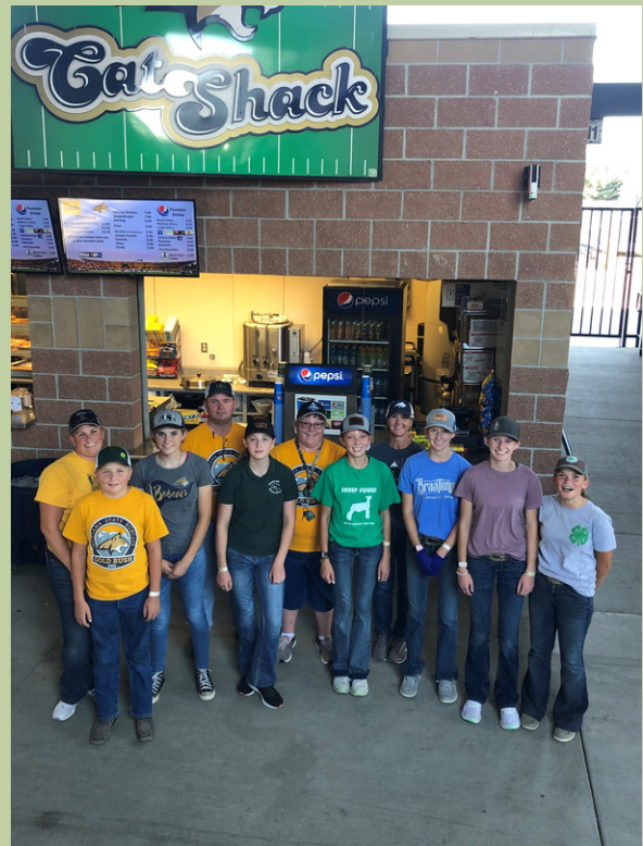
MSU Bobcat football game fundraiser, selling concessions.