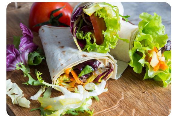
Participants prepare and/or taste new recipes at each lesson.