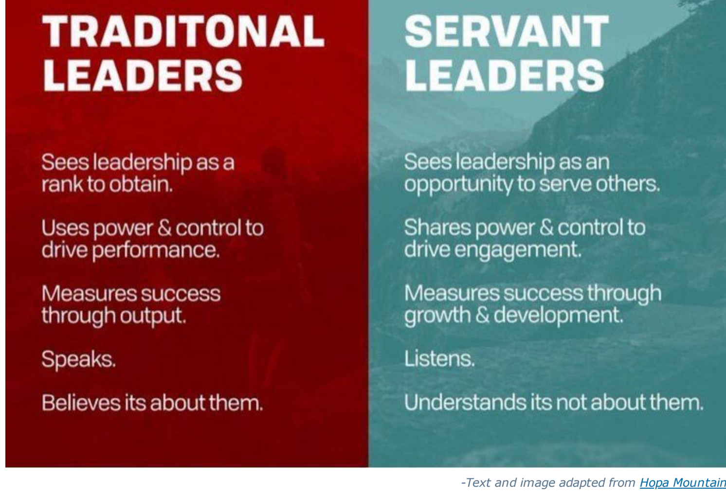
-Text and image adapted from Hopa Mountain .

Think about effective servant leaders in your community? What characteristics do they have? What can you learn from them?