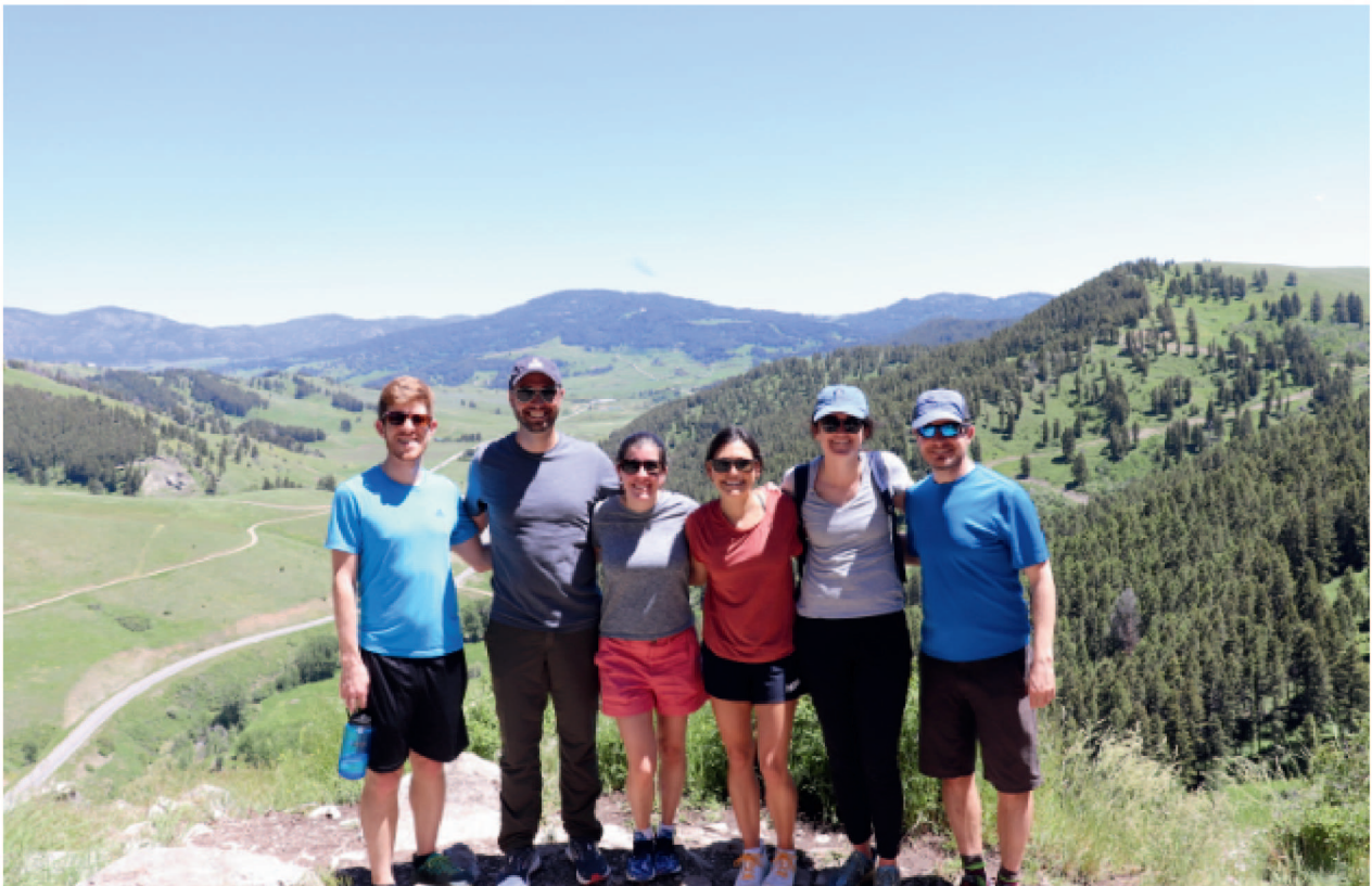
Conference participants enjoying a hike around Bozeman