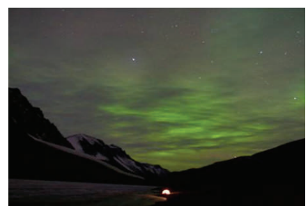
Aurora's over a lake side tent at Lake Bonney

The International Council for Science's outline for the IPY (ICSU 2004) states that projects should be multidisciplinary, international, and able to promote the next generation of polar scientists. Our extended season research brought scientists together with backgrounds in limnology, molecular biology, photobiology, microbiology and protozoology to address biological adaptations to cold and prolonged darkness. In addition to the multidisciplinary nature of the program, it brought together scientists from the U.S., UK, Canada and the Czech Republic and included 10 students who we hope will carry the legacy of IPY into the future.