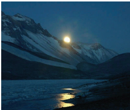
Moon setting over Lake Bonney (J.C. Priscu)

Research on the lakes of the McMurdo Dry Valleys (MCM) began with the advent of the International Geophysical Year (IGY) in the late 1950's. IGY research revealed the physical/chemical nature of the lakes, showing that they were the only year-round liquid water environments on the continent, and inferred that the biological systems in the permanently ice-covered lakes must possess novel physiological strategies that allow them to survive at low temperature and under extended darkness. The seminal studies during IGY provided the framework for subsequent hypotheses driven research which now forms the basis for the ongoing MCM Long Term Ecological Research (LTER) lake program (now in its 15 th season; www.mcmlter.org ) and the MCM dry valley lake Microbial Observatory ( www.mcm-dvlakesmo.montana.edu ).