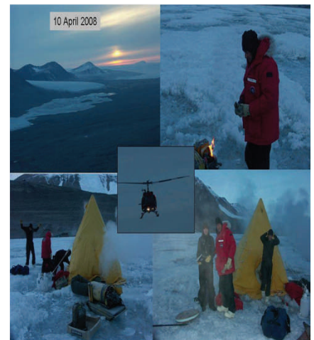
April operations in the Dry Valleys (J.C. Priscu)

As an example interesting results were observed from the east lobe of Lake Bonney. Firstly, chlorophyll-a continues to increase after phototrophic primary production has ceased and photosynthetic efficiency (i.e. light utilization index) is lowest during mid season. Preliminary data indicate that cryptomonads, a key phytoplankton group,