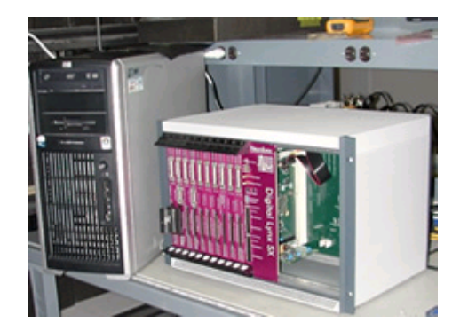
The modular Digital Lynx SX undergoes testing prior to heading to an MSU research laboratory.

Neuralynx, a high tech firm in Bozeman, is on a journey to becoming a medical device manufacturer where its signature products may provide information that will lead to effective future treatments for debilitating ailments. Assistance from the Montana Manufacturing Extension Center (MMEC) has helped the company achieve the quality system and certification for medical devices needed as the foundation to comply with U.S. Food and Drug Administration (FDA), CE Medical Device Directive Mark and other regulatory requirements for safety. These requirements must be met to sell its products into the medical device market here and abroad.