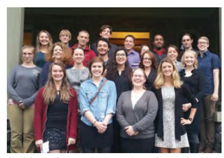
Recipients of department awards and/or scholarships.